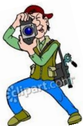
PHOTO DAY IS COMING - Thursday Oct 3

At this point, school will have been in session for almost two months and is an opportune time to hear how your child is progressing in his/her first term. The school will be sending you information on how you can sign up on-line for your 15 minute appointment. This way you can choose what time works best for you during the two day period. The appointment start times will be from 12:40 - 5:25 pm on Wednesday Oct 23; and from 12:40 - 2:25 pm on Thursday Oct 24 (with teachers blocking out short time frames for a nutrition break). You will be informed via email on how/when to log on to sign up for your conference times. Note that report cards for term one go home on Dec. 20 th .